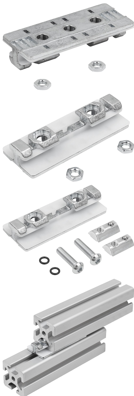
Fixed bearing with M6 screws.