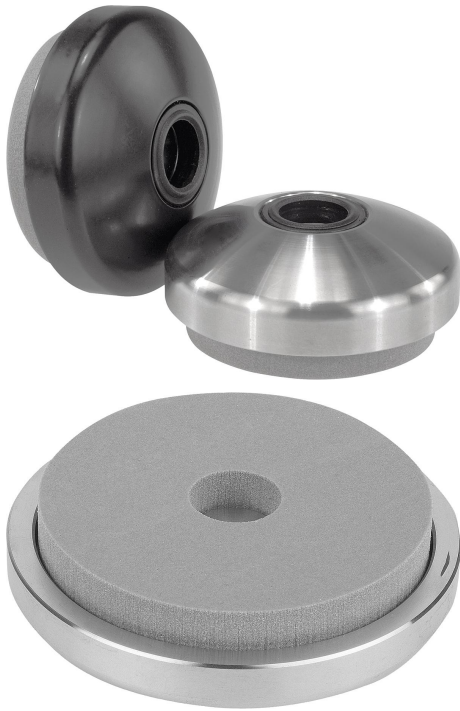
Plate die-cast zinc or stainless steel 1.4305. Damper plate PUR elastomere (Sylomer V12).

Die-cast zinc plate, black powder-coated. Stainless steel plate, bright. Damper plate, grey, glued in, anti-slip. Temp. range -30 °C to +70 °C.